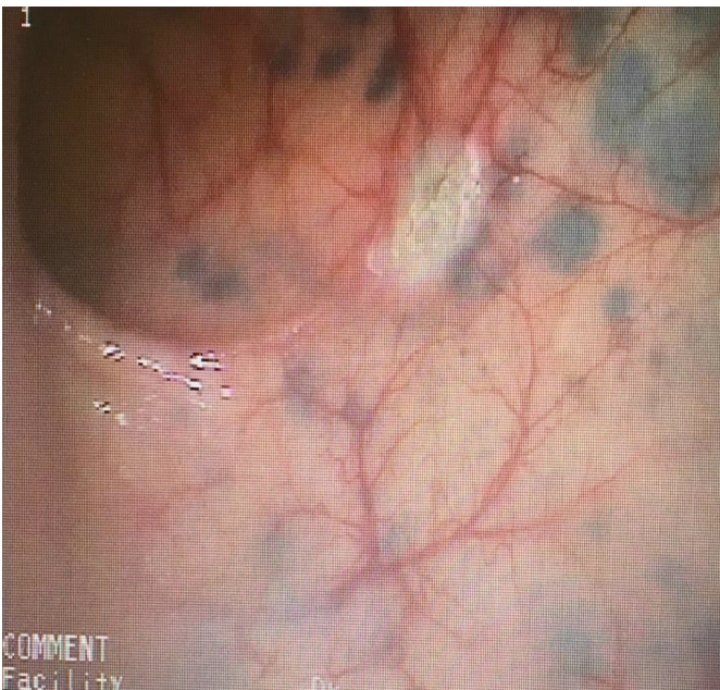
Figure 2: Colonoscopy image of the patient.