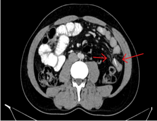
Figure 1: Axial computerised tomography scan showing the foreign body and appearance of free air in the abdominal cavity.

A relatively early diagnosis was made for the patient, who had no clinical signs of acute abdomen, by using imaging methods and the operation was completed laparoscopically (Figure 2). On the third day after the operation, the patient was discharged without any complications.