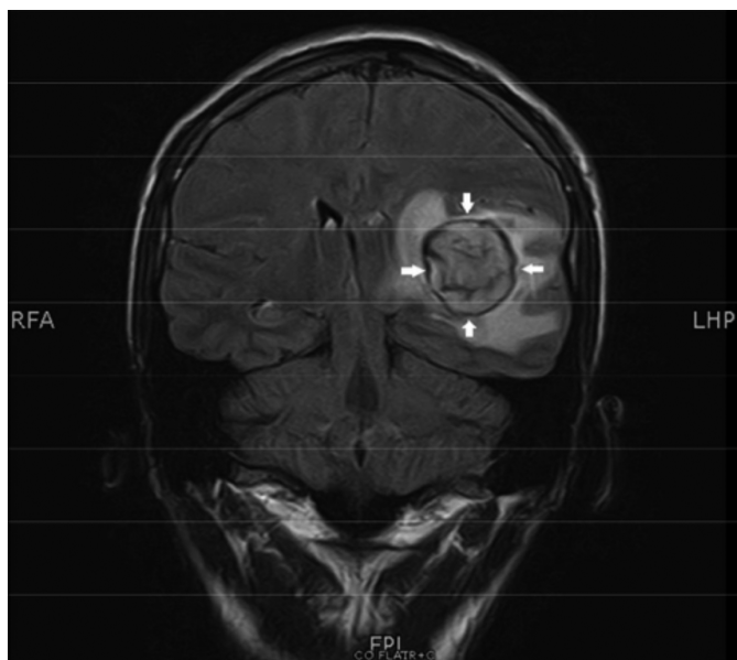
Figure 2: MRI brain FLAIR sequence coronal view. Brain abscess with surrounding oedema in left temporo-parietal lobe.

Lumbar puncture was not attempted due to space occupying lesion in brain on MRI. Transthoracic echocardiogram was done to rule out endocarditis, and showed viscerotrial situs solitus with dextrocardia without any evidence of vegetation. Patient was admitted in high dependency unit. Intravenous hydration with normal saline was started. He was given paracetamol intravenously on need basis for pain control and was empirically started on ceftriaxone 2000 mg twice daily intravenously.