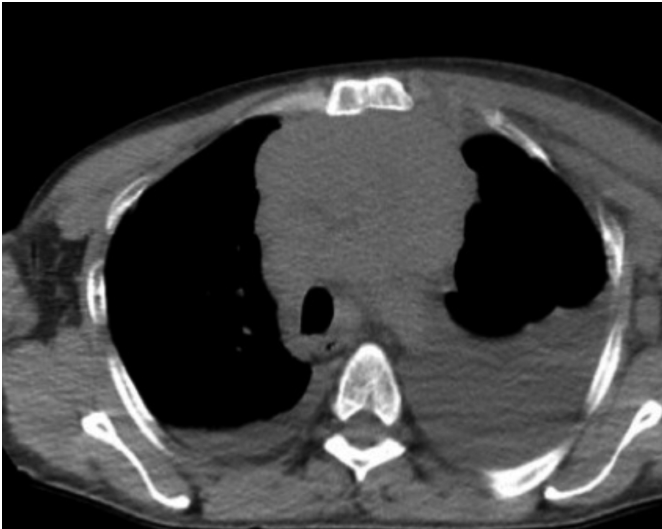
Figure 1: Computed tomography of the chest showing bilateral pleural effusion and mediastinal lymphadenopathy.