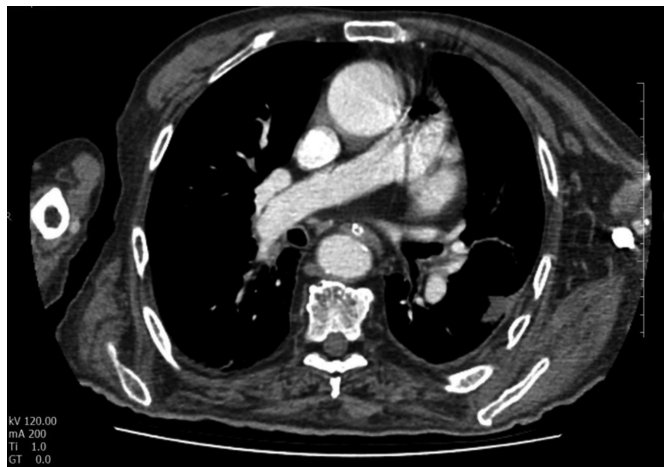
Figure 2: Contrast-enhanced axial CT scan of chest. Air is seen in the pulmonary artery.