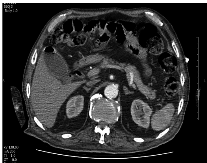
Figure 4: Contrast-enhanced axial CT scan of abdomen. Air is seen in the gallbladder.

Air embolism, a rare complication of gastroscopy, can have a subclinical course. The air can be detected on CT images even after several months. Clinicians should examine the patients' medical histories in detail, if they detect this frightening air image.