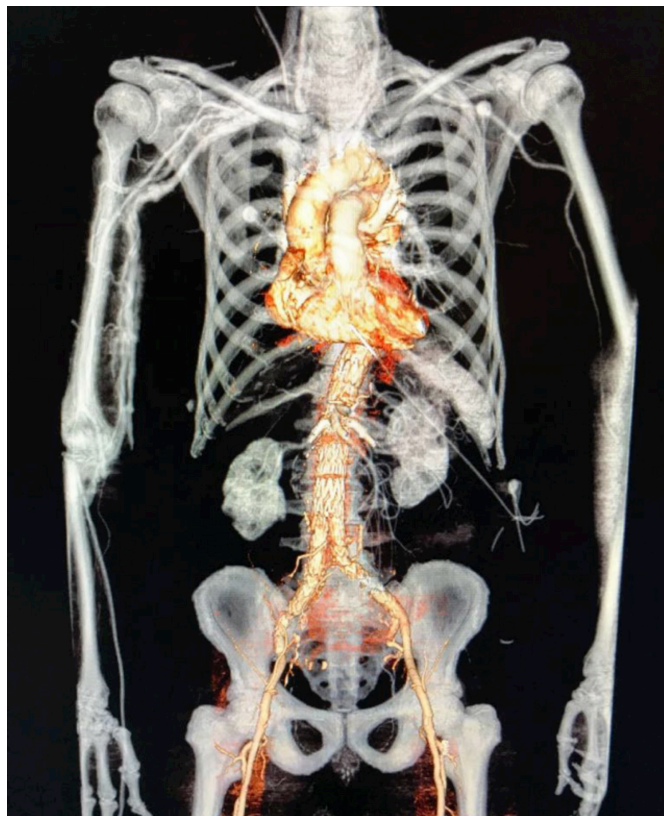
Figure 3: 3D reconstructed computed aortogram with fenestrated graft in place.