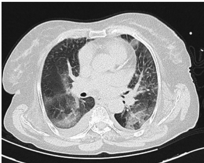
Figure 1: Axial CT of chest. Widespread ground-glass opacities are seen in peripheral distribution; accompanying pleural effusion is also present.