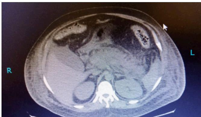
Figure 2: CT scans showing features of acute pancreatitis.

PaO 2 /FiO 2 ratio was 250. A contrast-enhanced computed tomography scan was done, indicating an edematous, diffusely enlarged pancreas with ill-defined borders (Figure 2).