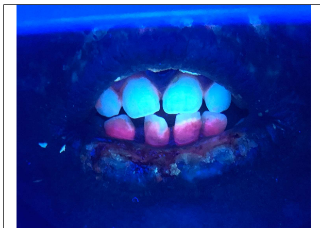
Figure 2: Woods lamp examination showing reddish brown discoloration of teeth.