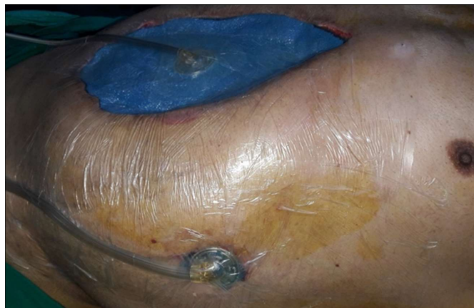
Figure 2: External view of the two-way vacuum-assisted closure technique.

patient and on the 15 th postoperative day for the third patient (Table I). The first patient was treated by another surgeon with planned relaparotomy technique from postoperative 6 th day to 17 th day and ESA was firstly performed with an uncovered stent on the postoperative 9 th day during planned relaparotomy. Afterwards, second ESA was carried out with two covered stents, one inside, the other on the postoperative 15 th day during planned relaparotomy. OA was performed with the two-way VAC technique on the 17 th postoperative day (Table I).