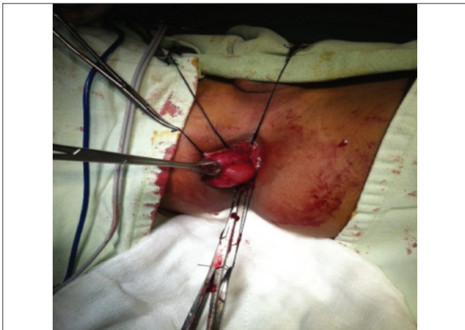
Figure 2: Cyst dissected out free from the rectal wall.

back to its normal place and repaired with vicryl interrupted sutures. After excision the cyst was opened, it contained thick tenacious white mucus.