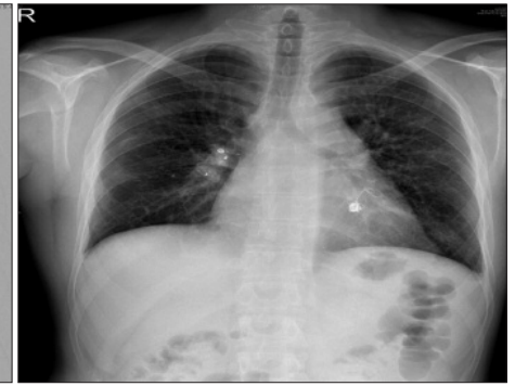
Figure 3: Chest Roentgenogram showing post-bilateral vascular plug and coiling, (vascular plug 2 (20 mm) right inferior branch of pulmonary artery with fibered coil in right upper and left lower lobe branches).

Fiberoptic bronchoscopy showed blood within left main bronchus. Echocardiography showed Pulmonary Arterial Pressure (PAP) of 70 mmHg.