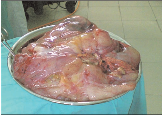
Figure 2: Tumour after the resection.